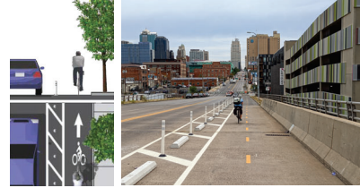
At-Grade Cycle Track with Bollard Protection