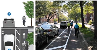
At-Grade Cycle Track with Parking Protection