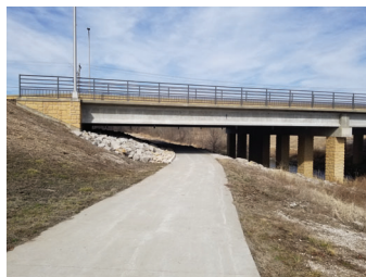
Little Blue Trace Trail