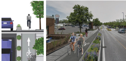
Raised and Protected Cycle Track